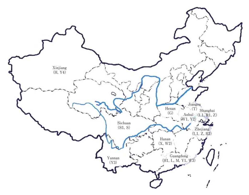
Fig. 1. Map of collection sites in this study. It contains the provinces for sample collection, and different capital letter/number combinations in the parentheses represent different chicken populations: S - Wild Swan goose; L - Lion-head; Z - Zhedong White; Y1 - Yangjiang; M - Magang; S1- Sichuan; G - Gushi; H - Huoyan; T - Taihu; W1 - Wanxi; W2 - Wugang; W3 - Wuzong; X - Xupu; Y2 - Yan; Y3 - Yunnan; Y4 - Yili; H1 - Hybrid; R1 - White Roman; R2 - Rhine; L1 - Landoise.

were collected from different family lines or unimproved village where geese were raised under free-range scavenging system, with two birds per line. In this study, the protocol was approved by the Committee on the Care and Use of Laboratory Animals of the State-level Animal Experimental Teaching Demonstration Center of Sichuan Agricultural University (Approval ID: Decree No. 20 [2003]).